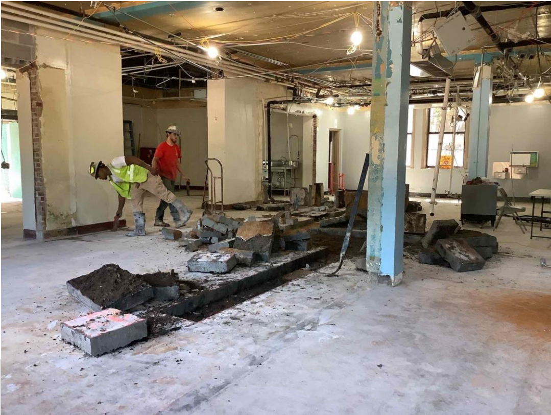
Concrete cutting for underground plumbing rough-in