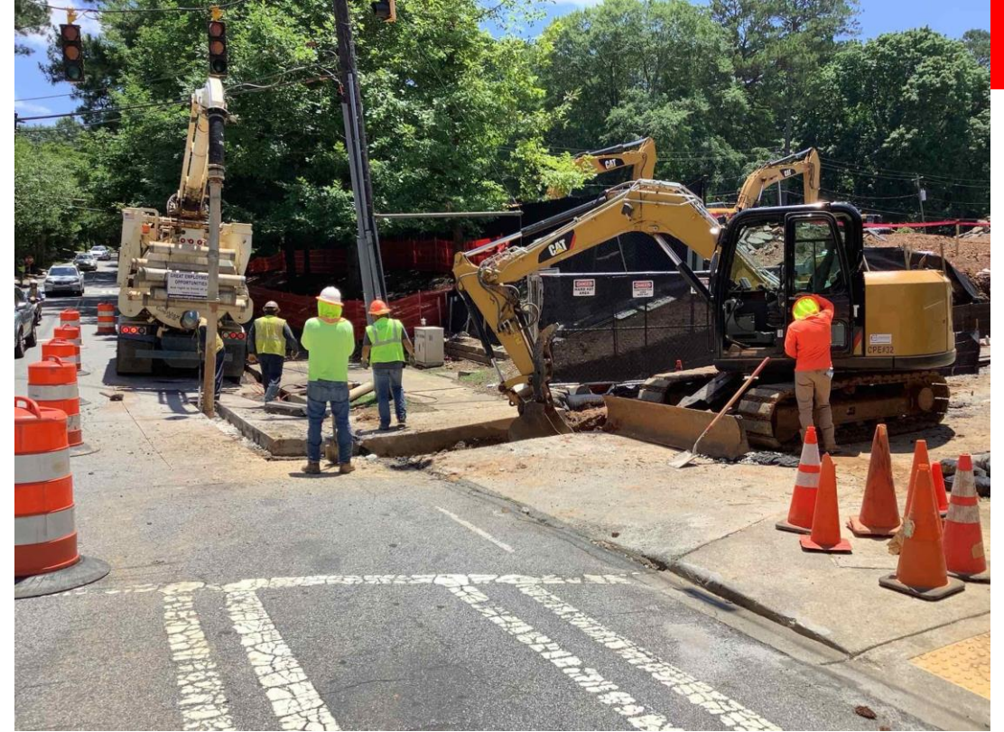
Storm drainage installation