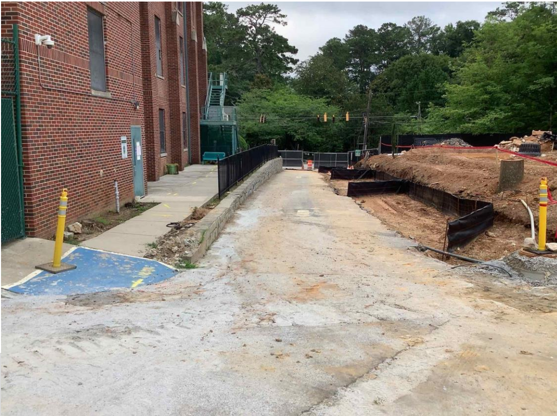
Erosion control measures